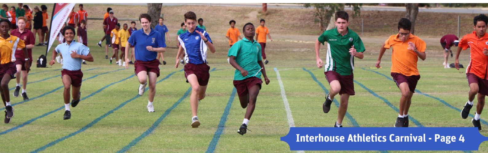
Interhouse Athletics Carnival - Page 4